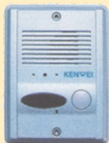
Kw-d20/c – Outdoor Unit with Pin-hole Camera

Power supply AC 100 – 240 Volt and DC 13.5 for option