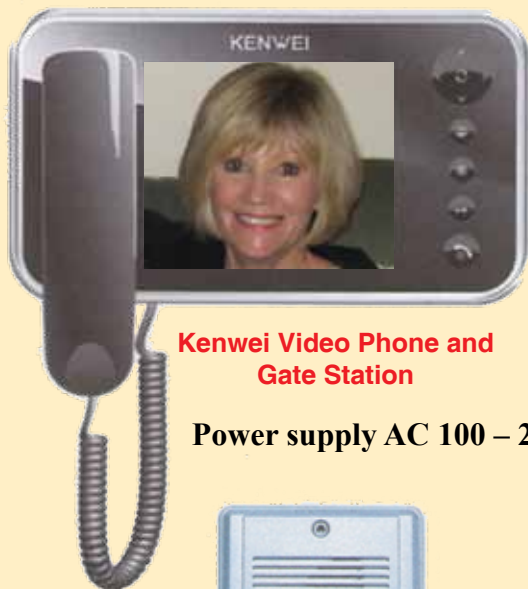
Kenwei Video Phone and Gate Station

Introducing the new colour video intercom from Kenwei – the E560C / . 5.6" colour indoor unit for ONLY R1,829