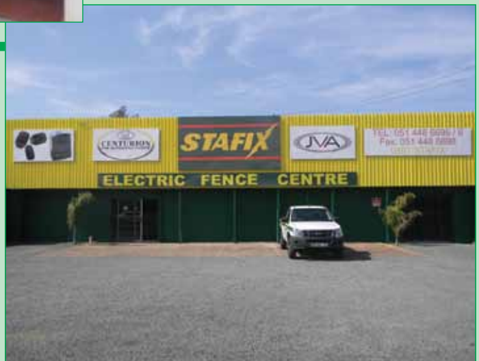
The new Bloemfontein outlet

New Address: 36 Kolbe Lane, Bloemfontein. Tel 051 448 6695.