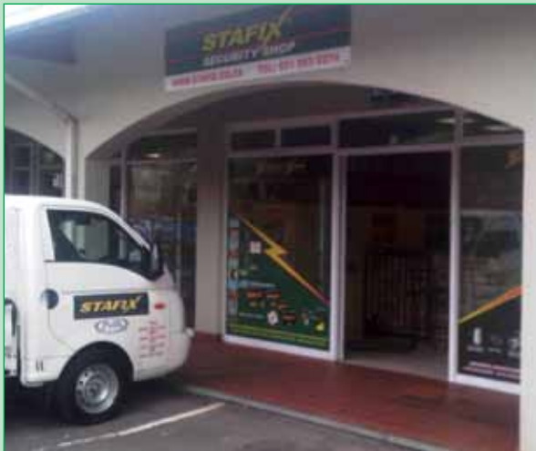
The new Durban North shop

The address of this new shop is: Shop 11, Arcadia Center, 87 Umhlanga Rocks Drive, Durban North. Phone 031 563 0274.